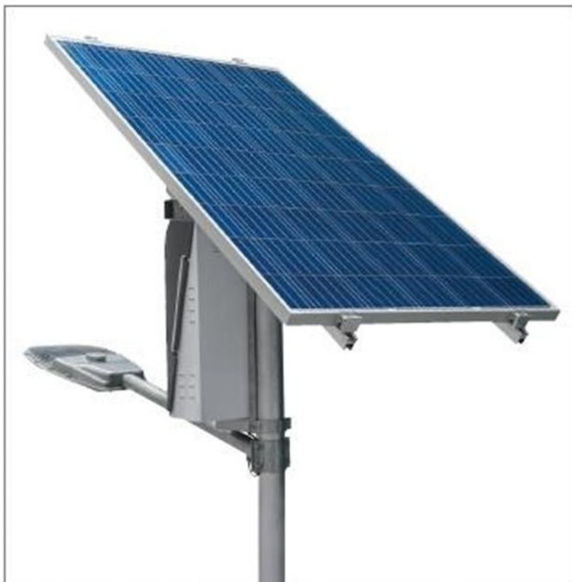
Highly efficient Polycrystalline solar module technology to maximise solar energy conversion