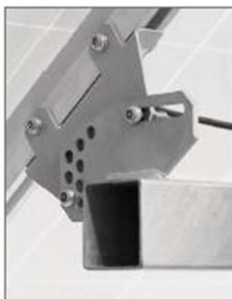
Adjustable solar module inclination angle optimised for various geographical locations.