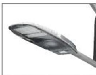
Highly efficient, performing and robust