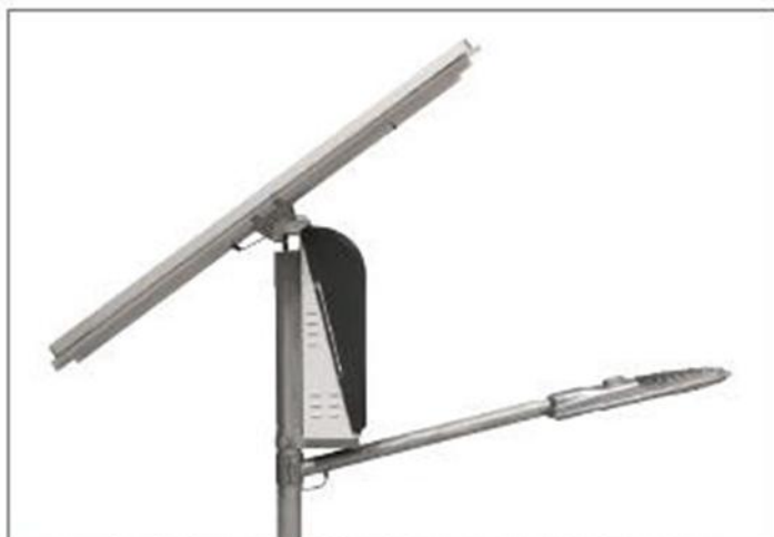
Fully integrated solar system, including solar module, battery enclosure, luminaire and pole.