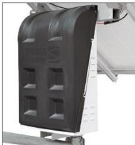
Robust and theft-resistant battery enclosure design. Easily accessible by means of a special key. Up to four days autonomy.